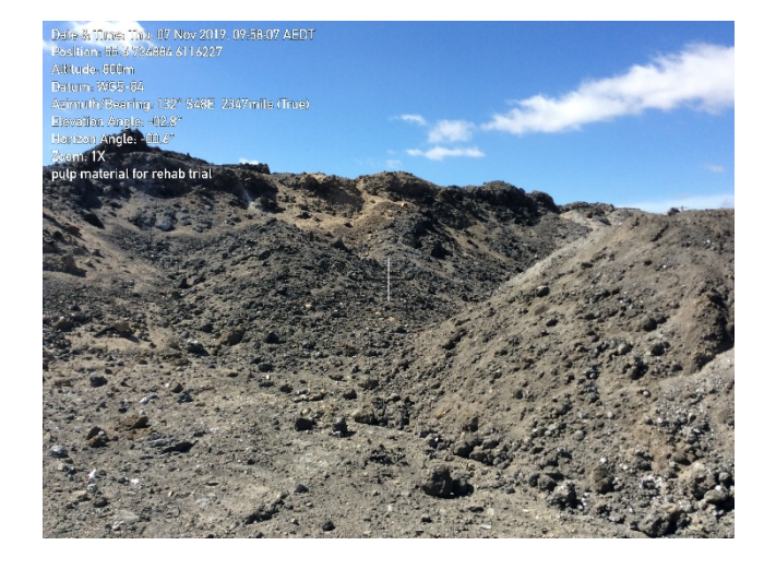
Figure 4 Processed pulp material at TD North

Section 5.1.4 broadly discussed the rehabilitation program for Domain 4 - New Infrastructure (Hickory's Paddock). This section stated 'Areas of Hickory's Paddock remaining outside of the proposed processing facility and associated infrastructure will be progressively rehabilitated as necessary'. The MOP indicated that this work would be done shortly after construction was completed and within the first two years of the MOP period (which ended in August 2017). Section 4.2 of the 2018-2019 Annual Review indicated that construction was completed during that reporting period. The area was inspected as part of the audit site inspection. Tarago Operations staff advised that cropping was undertaken on the Hickory's Paddock area in 2018 and 2019 to develop organic matter in the soil and to provide temporary