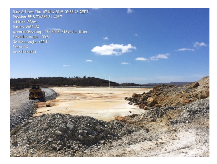
Figure 3 Area of capping trial on TD North

Section 5.1.2 broadly discussed the rehabilitation program for Domain 2 Tailings storage facilities. This described two options for capping and rehabilitation of the tailings dams. During the audit, Tarago Operations advised that a capping trial using Option 1 was about to begin on a five-hectare area of Tailings Dam North (Figure 3). The trial was planned to be conducted over five years, and the results would be used to refine the capping design for use in rehabilitation of the other TSFs on site. The trial was proposing to use the processed pulp material as one of the neutralising layers for the acidic nature of the tailings (Figure 4).