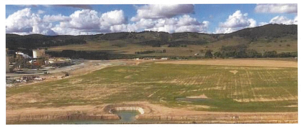
Figure 1. Overview of Hickorys Paddock rehabilitation, millet crop (March 2019)

6. Observation of Concern no. 5. Compliance and environmental incident reporting. As a