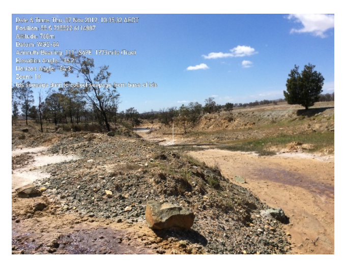
Figure 12 Salt formation in seepage area

Figure 11 Seepage collection dam below TD South