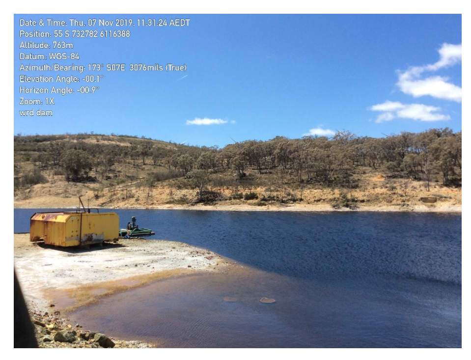
Figure 2 Waste rock emplacement seepage dam

The MOP referenced the Waste rock management plan for the management of potential acid forming wastes (PAF). During the audit, Tarago Operations advised that 11 samples had been sent to ALS Brisbane for analysis and provided laboratory results to indicate that PAF material had been detected underground. The characterisation of waste rock at the surface in the new waste rock dump showed that material was non-acid forming (NAF). NAF material was being stockpiled at Veolia's operations. Tarago Operations advised that the PAF material was being stockpiled above TSF4, with all drainage from that area reporting to TSF4. The storage of PAF in this location was not described in the approved MOP. Despite the MOP indicating that there was likely to be more NAF than PAF, recent analyses indicated the opposite appeared to be the case. There may be a need for the Tarago Operations to revise both the MOP and the waste rock management plan to provide for alternate options for the management of PAF material. This is raised as observation of concern no. 3 .