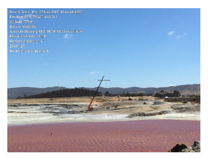
Figure 9 View over TD West

Figure 8 Tailings Dam South - reprocessing in progress