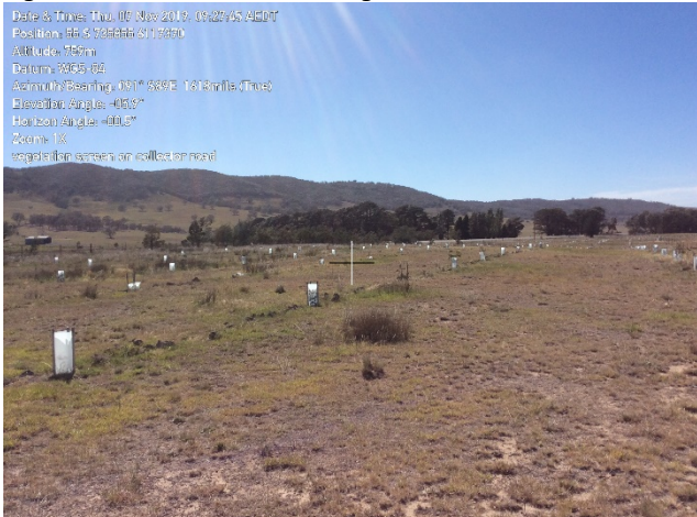
Figure 6 Example of tree survival in the tree screen

Figure 5 Tree screen area along Collector Road