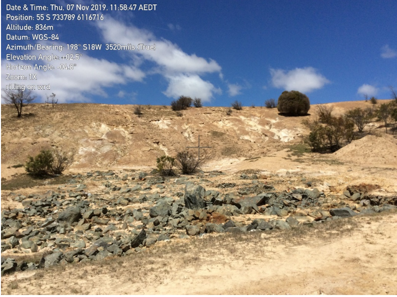
Figure 1 Vegetation failure and erosion on the western face of the waste rock emplacement

Section 6 of the MOP outlined the performance indicators and completion criteria for various mine phases and domains. In the construction phase, the completion criteria for Tailings Storage Facility 4 was a lining to achieve 1 \times 10^{-9} m/s to a depth of at least 900 millimetres of clay or equivalent. Permeability test results (Douglas Partners) were provided as evidence to demonstrate that the required permeability was achieved. The average of the testing was 6 \times 10^{-10} m/s which was in excess of the required criteria.