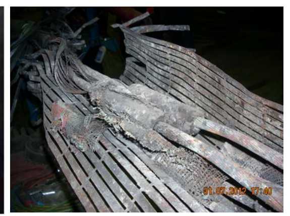
Figure 2: What remained inside the cable splice cage.