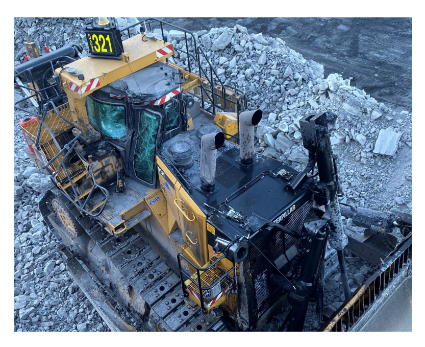
Figures 1 and 2: Damage to the structure of the dozer cabin and other dozer components

A dangerous incident occurred as a dozer passed through the off-side swing radius of a large excavator as it was slewing. The rear counterweight passed over the dozer blade and struck the cabin structure of the dozer (see Figures 1 and 2). The dozer operator was not injured.