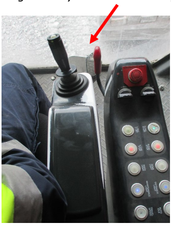
Figure 5: Hydraulic isolation - pilot control shut-off lever located beside the excavator operator's seat

The mine site has installed coloured warning lights on mobile mining equipment (dozers and small excavators). The coloured light system provides confirmation of pos-com to nearby mobile plant operators. The light system is not used to indicate isolation status. The coloured light system was not available on the larger excavators at the mine.