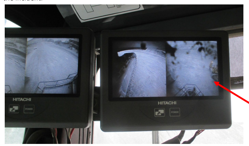
Figure 4: Two display screens in the excavator cabin depicting camera views of what could have been displayed at the time of the incident.

Left display screen – split screen showing the two rear facing cameras