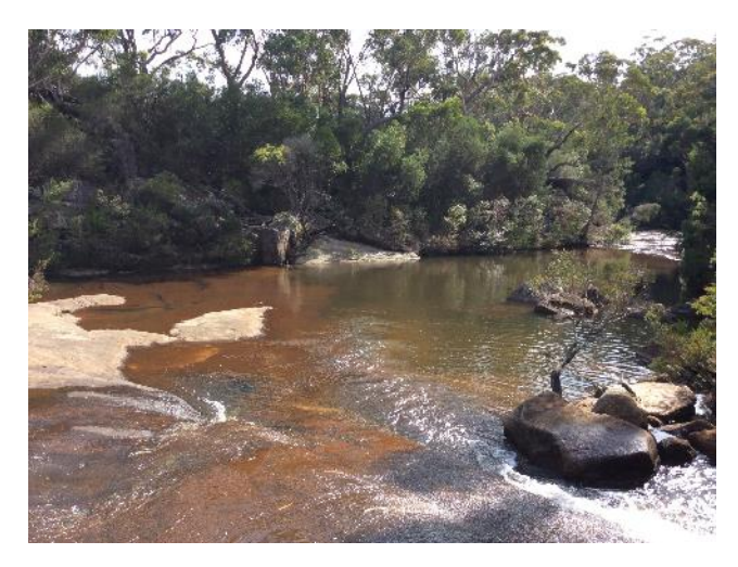
Figure 4 Example of surface cracking in Pool I rock bar