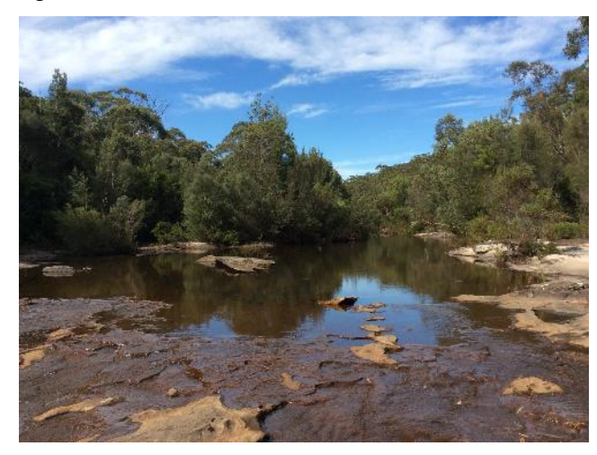
Figure 2 Water flowing over Pool F rock bar