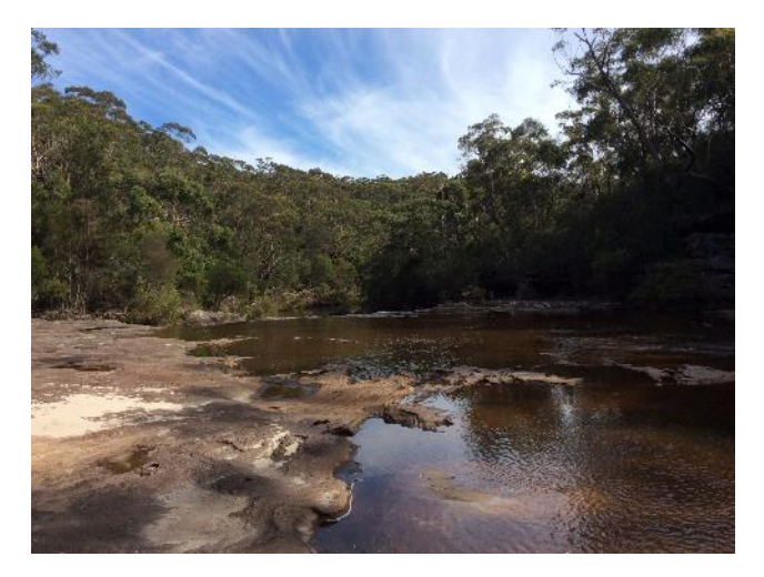
Figure 6 Rock ledges adjacent to Pool J