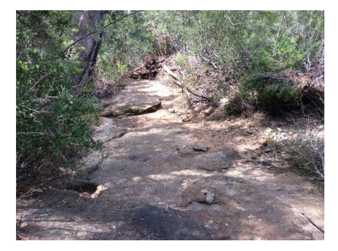
Figure 9 Tributary B Pool RTP2 looking downstream

Tributary B was dry at the time of the audit (refer to Figure 9 and Figure 10), but Metropolitan staff advised that this stream was intermittent and generally only flowed after a significant rainfall event. No specific remediation was proposed for site RTP2.