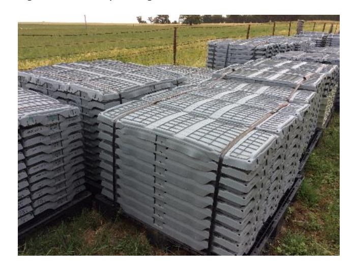
Figure 8 Core tray storage