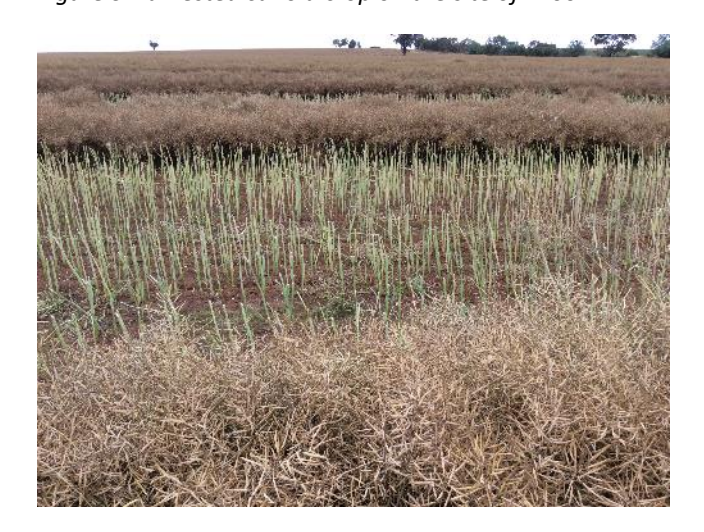
Figure 5 Harvested canola crop on the site of JN0022