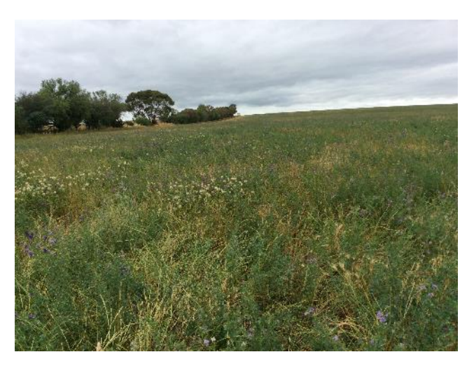
Figure 7 Rehabilitation at site JN0011