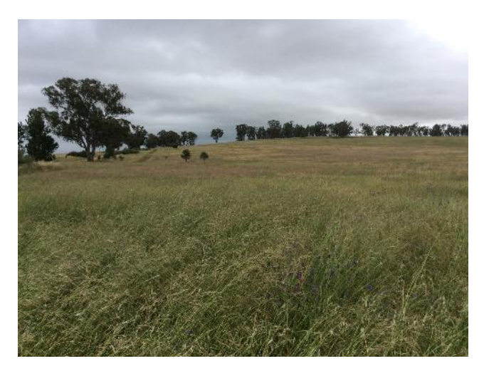
Figure 5 Harvested canola crop on the site of JN0022