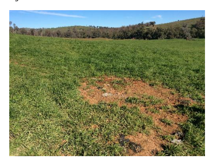
Figure 3 Site KIODD002