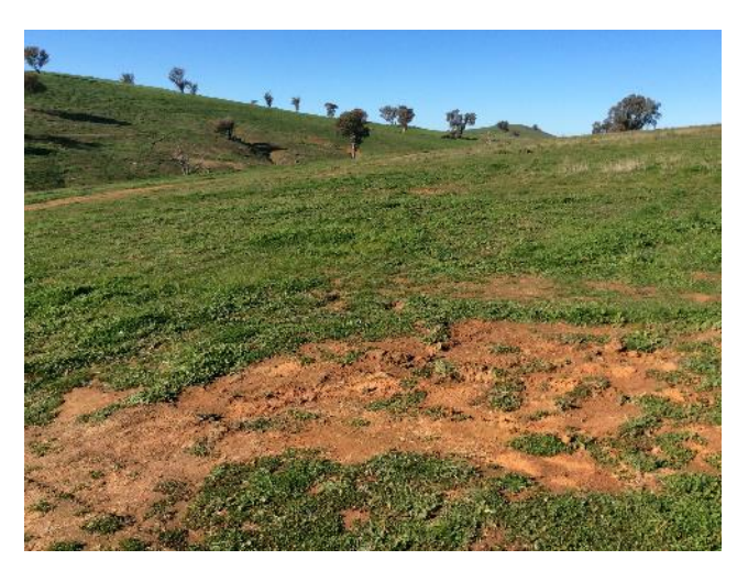
Figure 2 Site KIODD001