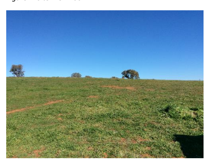
Figure 4 Site KIODD001