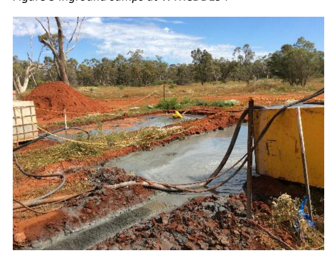
Figure 5 Inground sumps at WTRCDD194