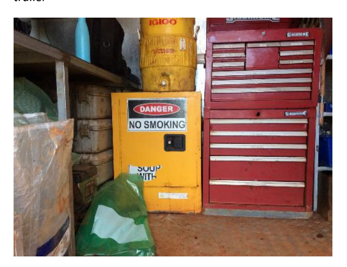
Figure 2 Dangerous goods cabinet inside the driller's trailer