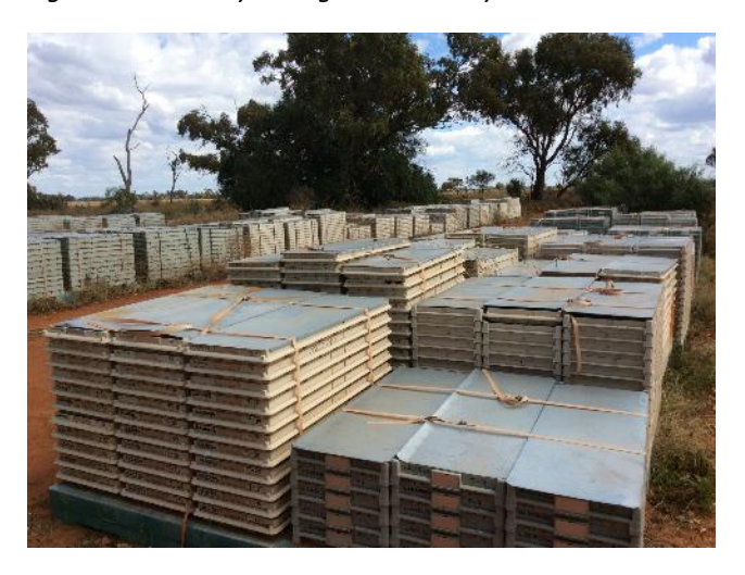
Figure 11 Core tray storage in the core yard