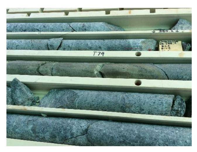
Figure 12 Example of core in the core tray