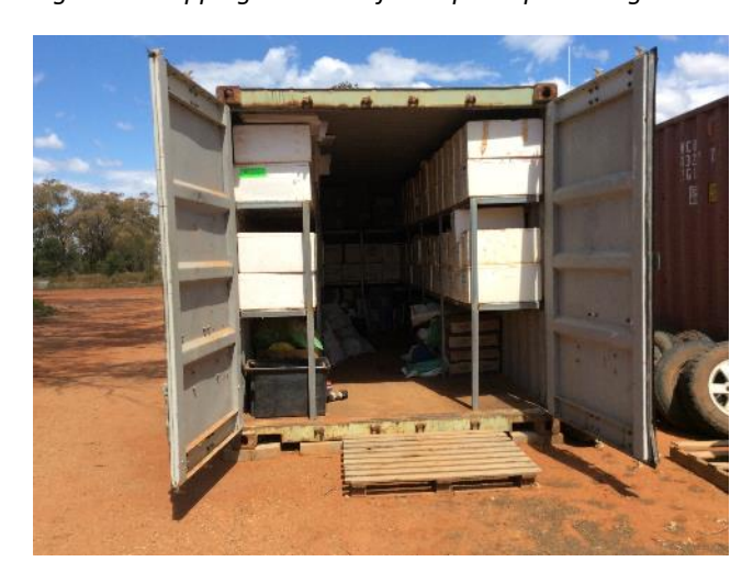
Figure 13 Shipping container for chip sample storage