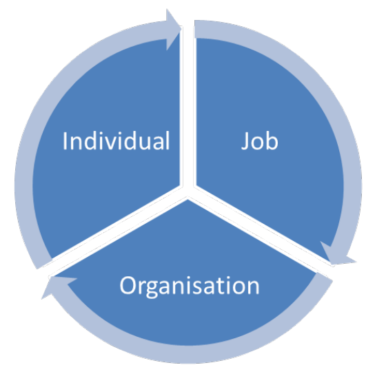
Figure 1: Considerations for human and organisational factors.

This factsheet outlines ten human and organisational factors that will, if optimised, reduce the likelihood of all types of human failure.