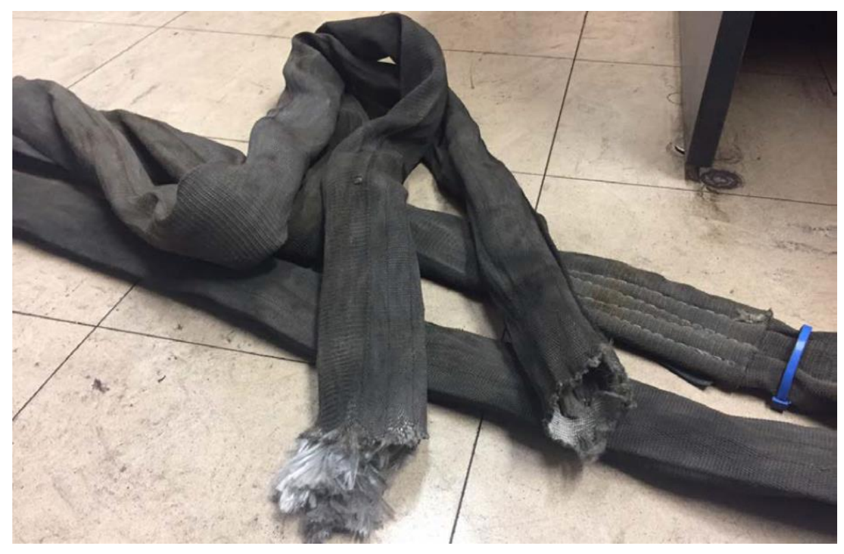
Figure 2: The failed sling

As the Mechanical Engineer at the site, answer the following questions: