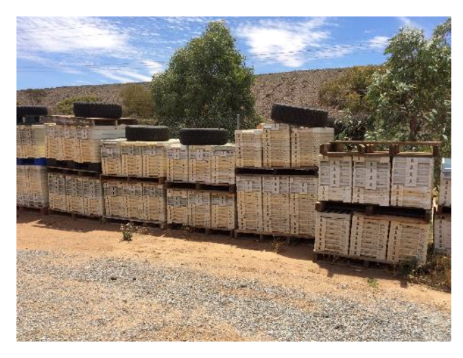
Figure 9 Example of core tray labelling

Figure 8 Core storage in the AUSSAM yard in Broken Hill