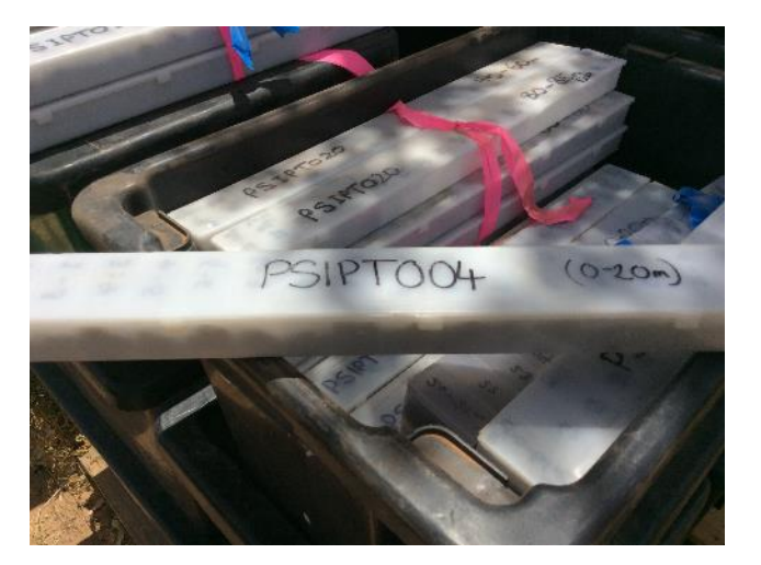
Figure 10 Example of chip tray labelling and storage