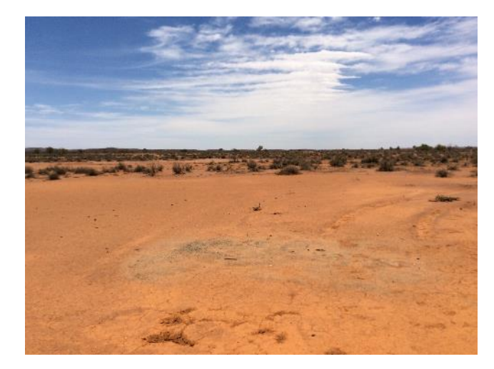
Figure 6 Rehabilitation of hole PN156

Examples of rehabilitation of the drill holes at Little Broken Hill Gabbro prospect are shown in Figure 6 and Figure 7.