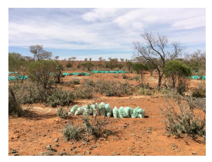
Figure 4 Close spaced drilling in the Platinum Springs area