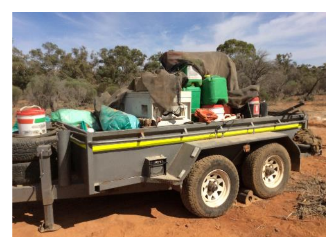
Figure 3 Spill kit in the box trailer

Figure 2 Drilling chemicals, fuels and oils stored in a box trailer