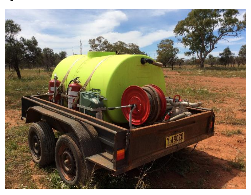
Figure 7 Fire trailer at 20BMDD011