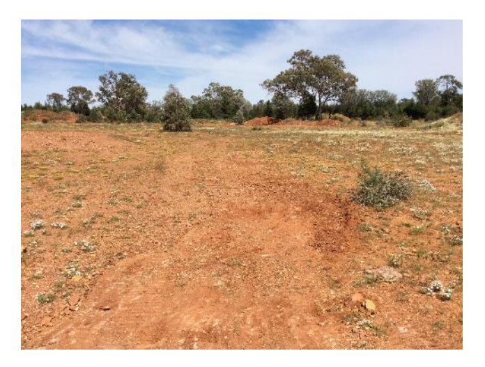
Figure 9 Rehabilitation on IP line 6393600