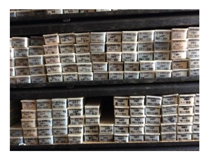
Figure 14 Well organised chip sample storage in shipping container