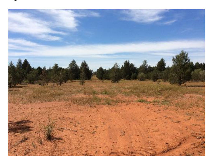
Figure 10 Rehabilitation at 19BMRC028