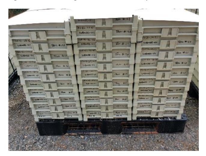
Figure 12 Core storage in modular core trays with lids