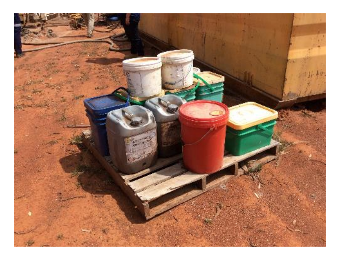
Figure 2 Bunding provided for chemicals following the site inspection