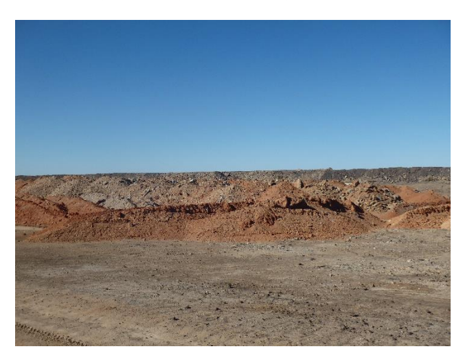
Figure 5 Topsoil stockpiled on the top of a waste emplacement at North Mine

Section 3 of the approved MOP for North Mine identified six key risks to rehabilitation that must be managed: