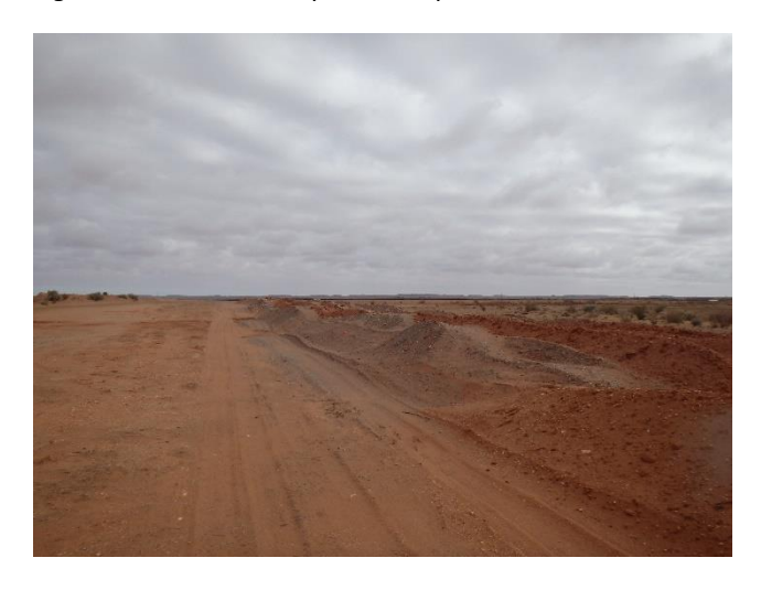
Figure 1 Windrowed topsoil stockpiles on cell 1 Site D TSF

Section 5 of the Southern Operations MOP describes the controls to manage the environmental issues associated with the mining and processing operations. Controls relevant to manage the risks to successful rehabilitation outcomes were reviewed during the audit, including: