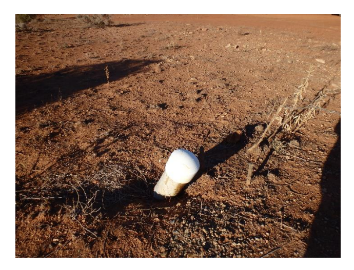
Figure 19 Hole drilled in 2008, casing still extending above ground level

After the previous audit of the Perilya exploration activities in 2016, the exploration manager introduced a rehabilitation diary to document rehabilitation completed on each drill hole and the ongoing monitoring of that rehabilitation. A review of the rehabilitation diary by the auditors showed that the diary was regularly maintained. Details of rehabilitation methods used are recorded for monitoring and evaluation. Monitoring photographs were taken six months and 12 months following the completion of drilling and stored electronically.