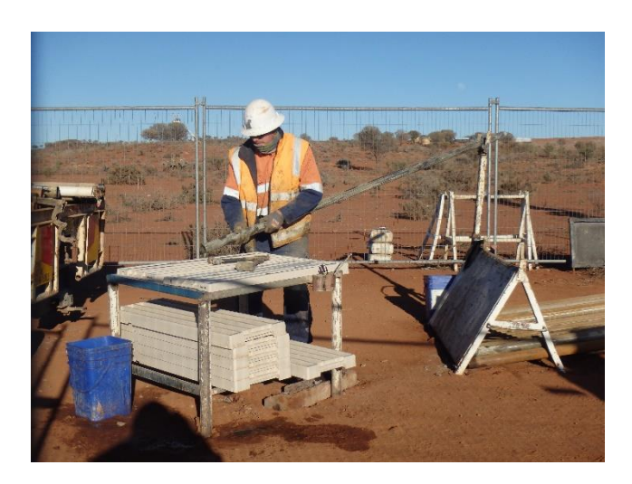
Figure 25 Core shed at North Mine with labelled core trays in the foreground