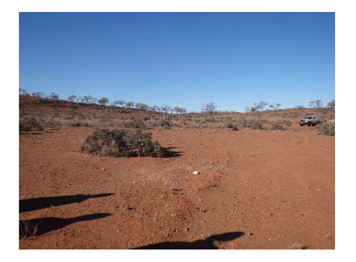
Figure 22 Hole LBH-111, drilled 2016 and capped