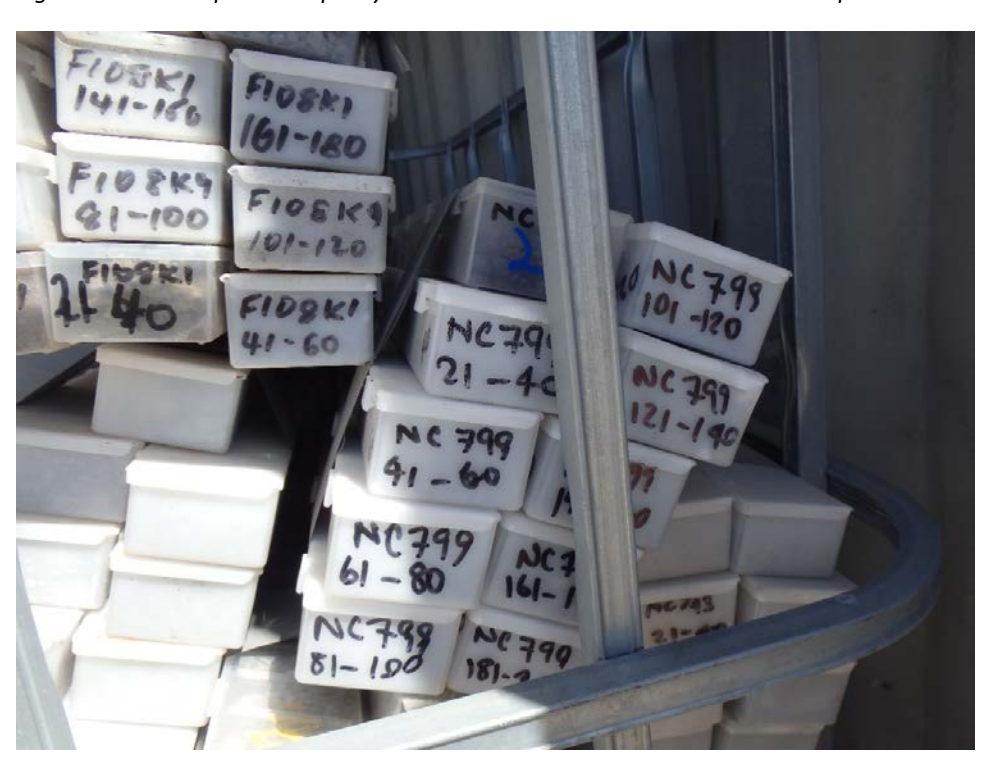
Figure 5 Chip sample trays in a metal framed pod within a shipping container