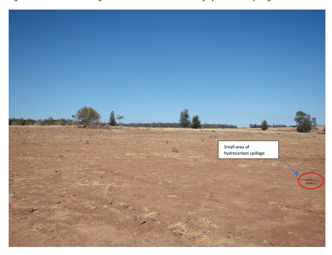
Figure 1 Site NC795 showing rehabilitation and small area of hydrocarbon spillage