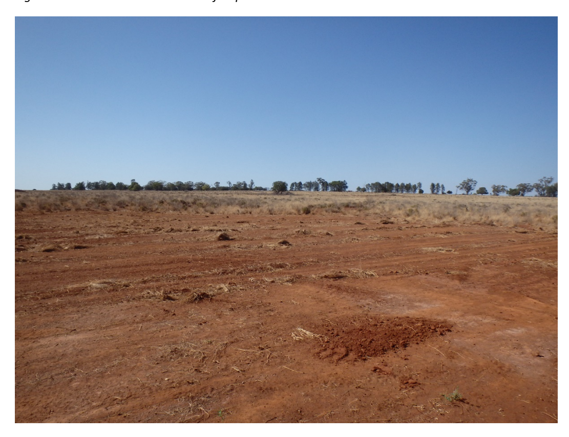
Figure 2 Site NC798 – rehabilitated flat paddock

A review of examples of drill plans provided, with the permits to work, did not show any specific erosion and sediment controls on the plans for any of the sites. No evidence was sighted to indicate that erosion and sediment control plans were prepared for each drill site (or group of drill sites) as part of the site planning process. This is raised as an observation of concern No. 1 .