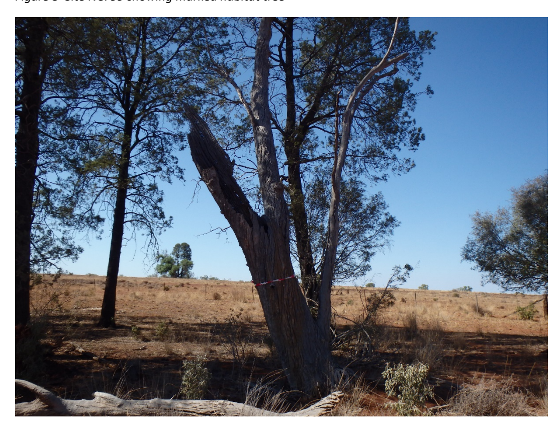
Figure 3 Site NC799 showing marked habitat tree