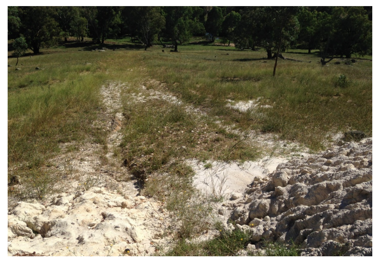
Figure 8 Erosion on road on northern edge of disturbed area (facing north)

Figure 7 Erosion – no evidence of pollution off site (facing north)