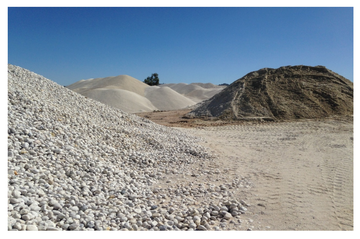
Figure 6 Erosion on northern edge of disturbed area (facing north)