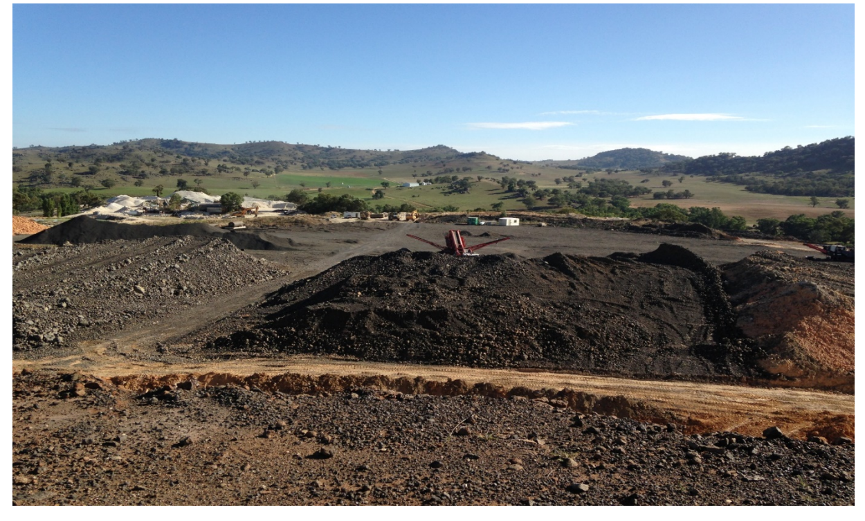
Figure 2 Quarry pit floor (facing south)

Figure 1 View across the operation (facing north)