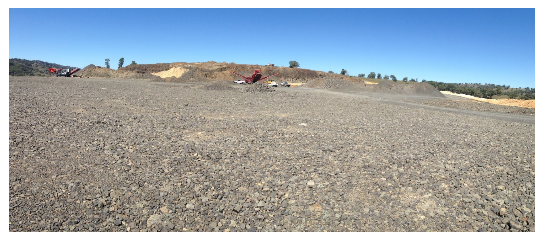
Figure 9 Progressive backfill on quarry floor