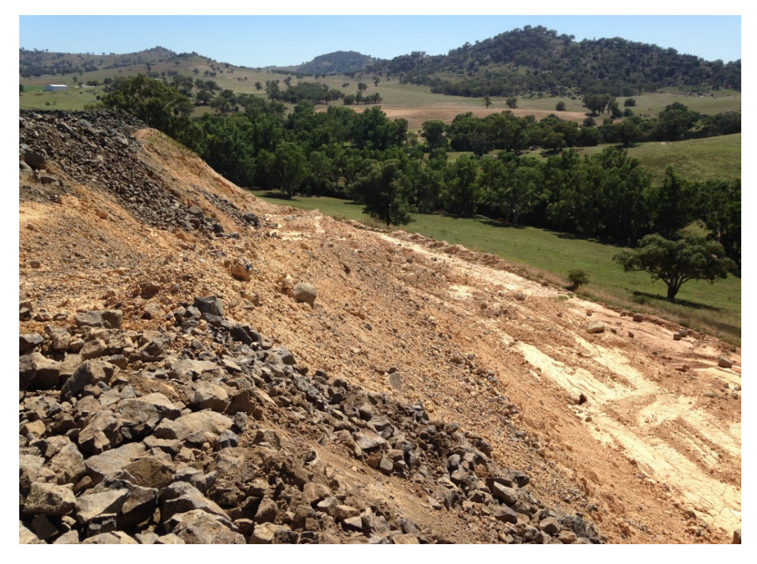
Figure 11 Rehabilitation on eastern side of operation (facing east)

Figure 10 Rehabilitation on eastern side of operation (facing north)