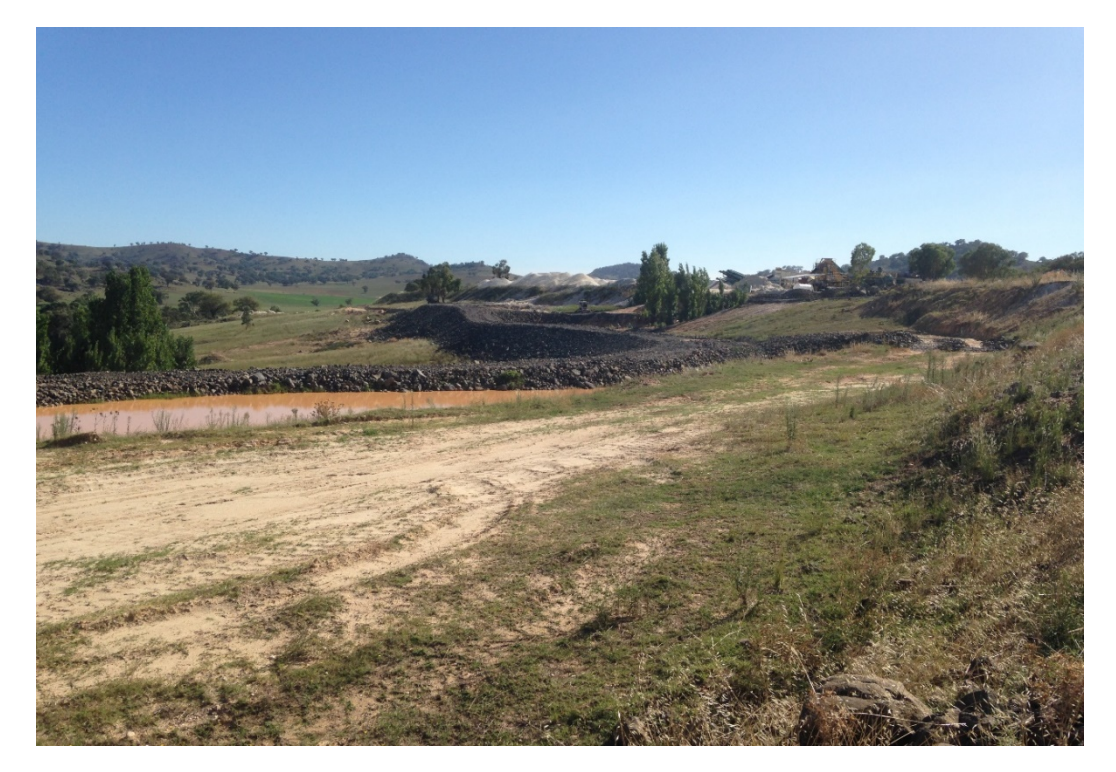
Figure 4 Example 2 of water management structures (western edge facing south)

Figure 3 Example 1 of water management structures (western edge facing north)