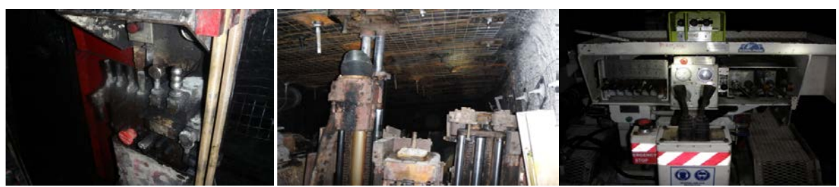
HMS Consultants Australia Pty Ltd PO Box 799, Newcastle 2300