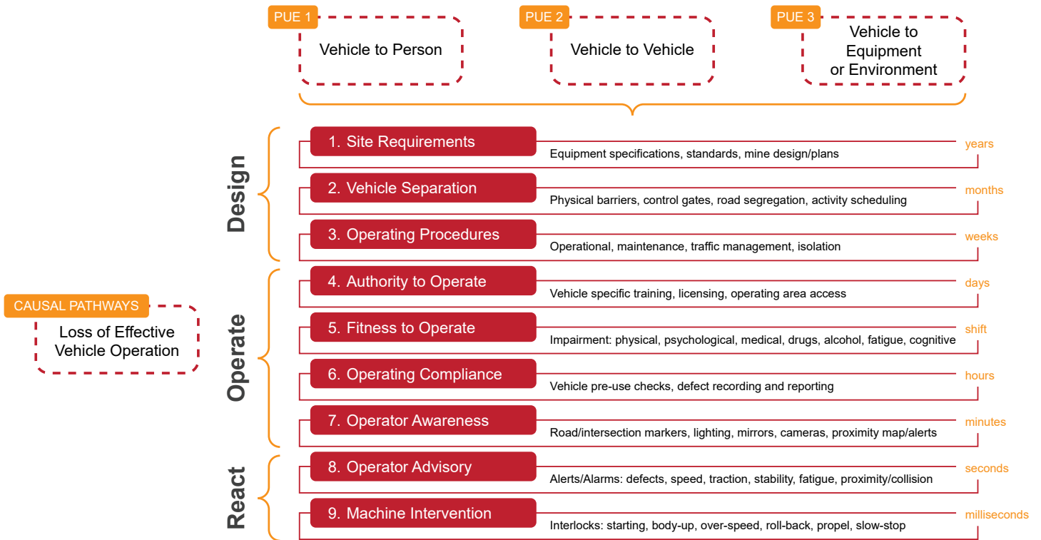
Figure 2. Vehicle interaction 9-layer defence approach