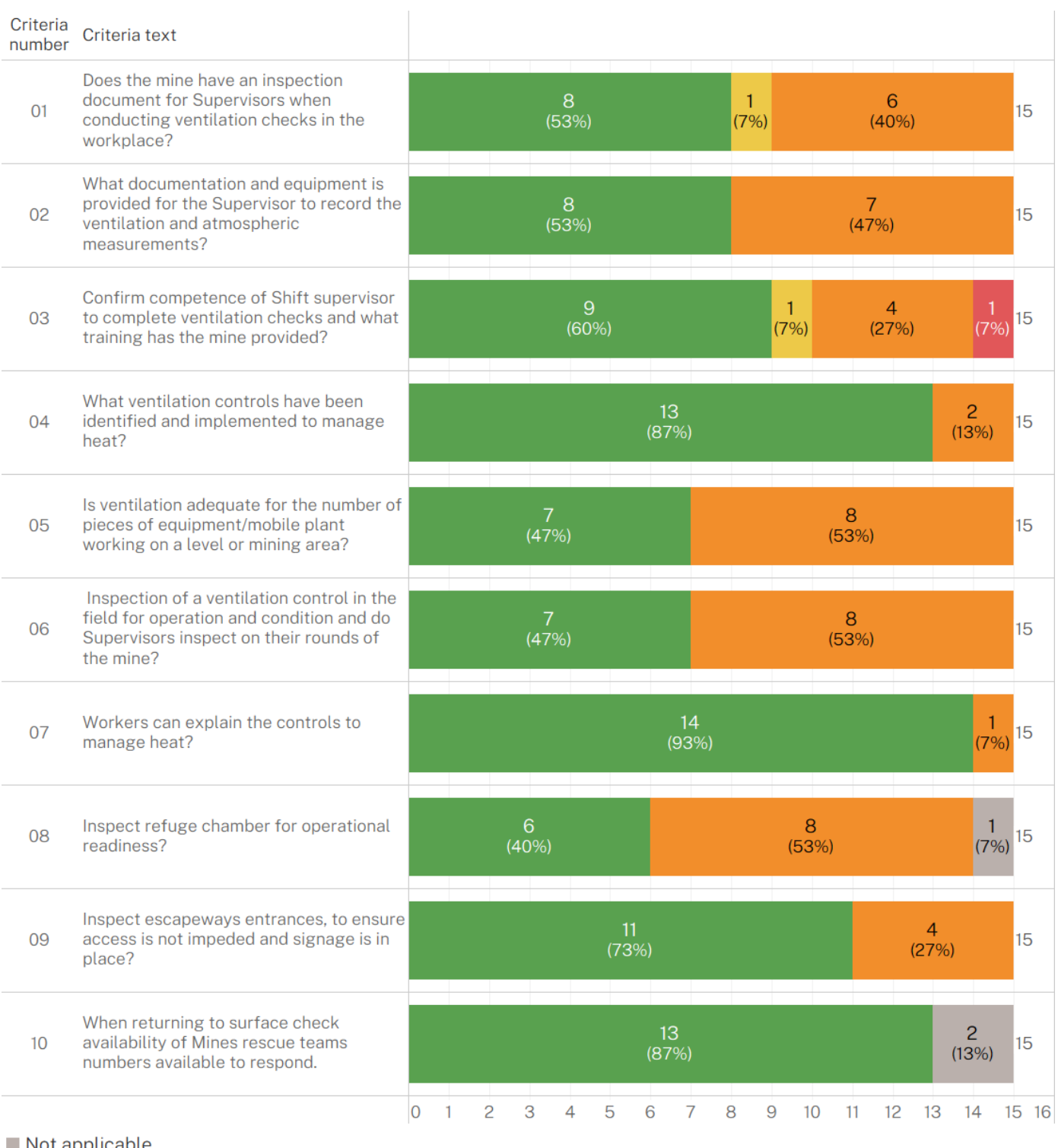
Figure 1. Summary of assessment findings by criteria