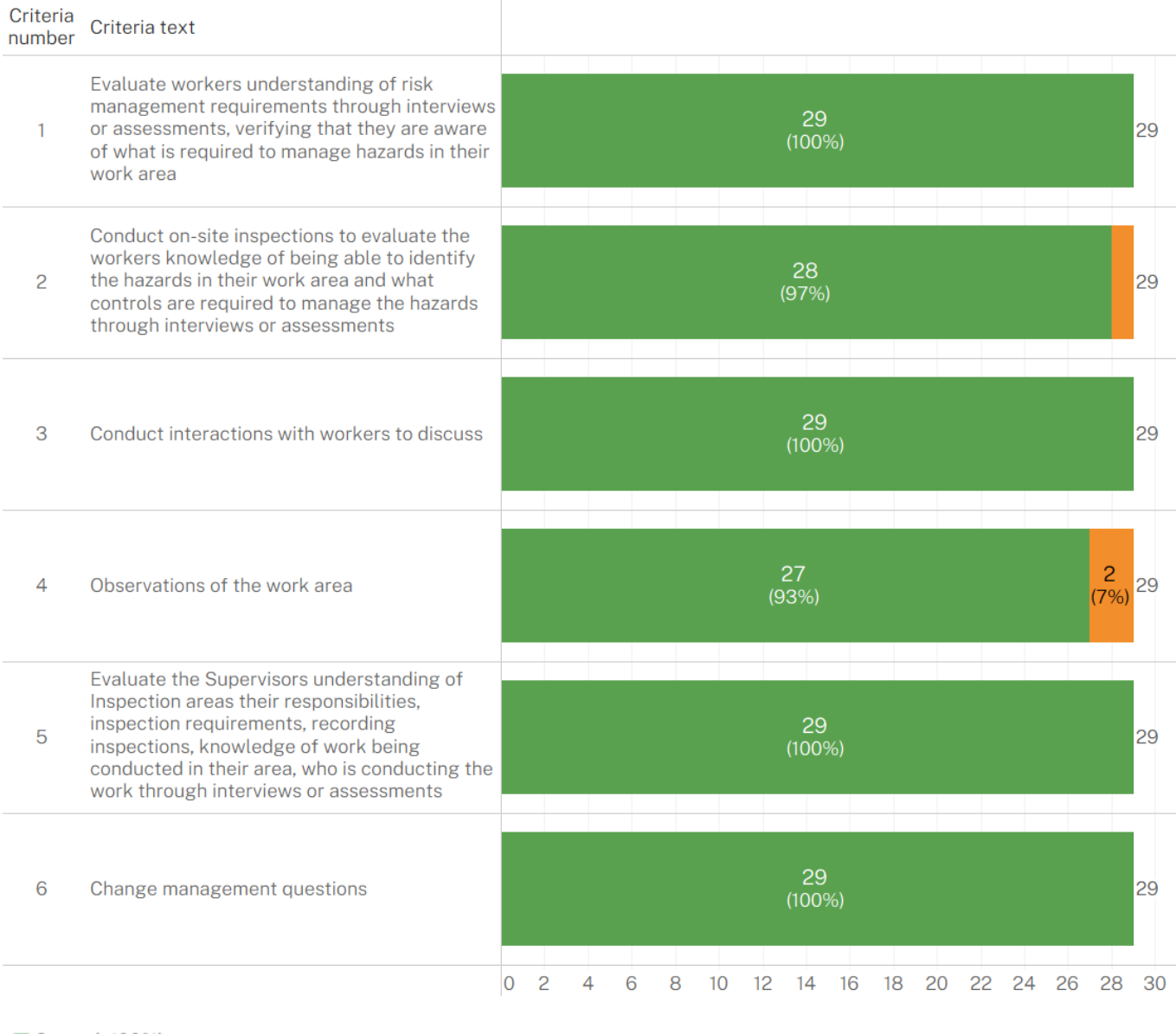
Figure 1. Summary of assessment findings by criteria

Green (=100%) Yellow (>= 80% and <100%)</li> Orange (>= 65% and <80%)</li> Red (<65%)</li>