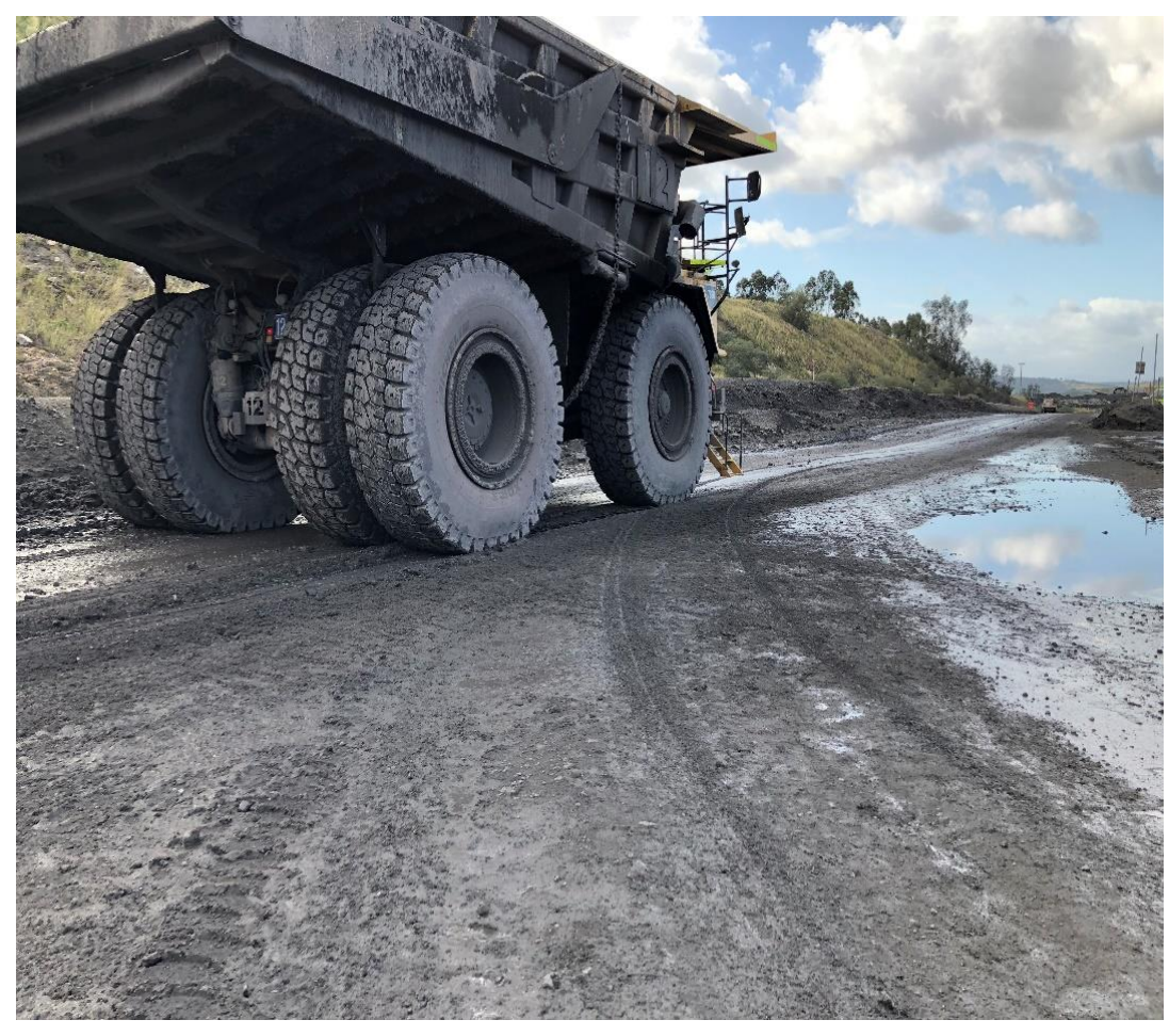
Light vehicle driver failed to see haul truck