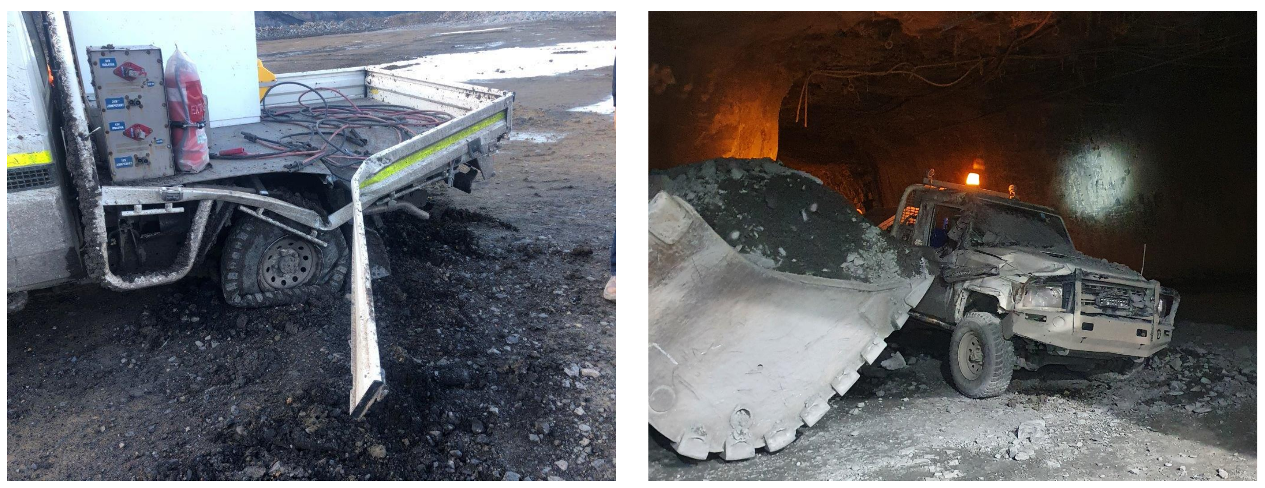
Failure to use positive communication