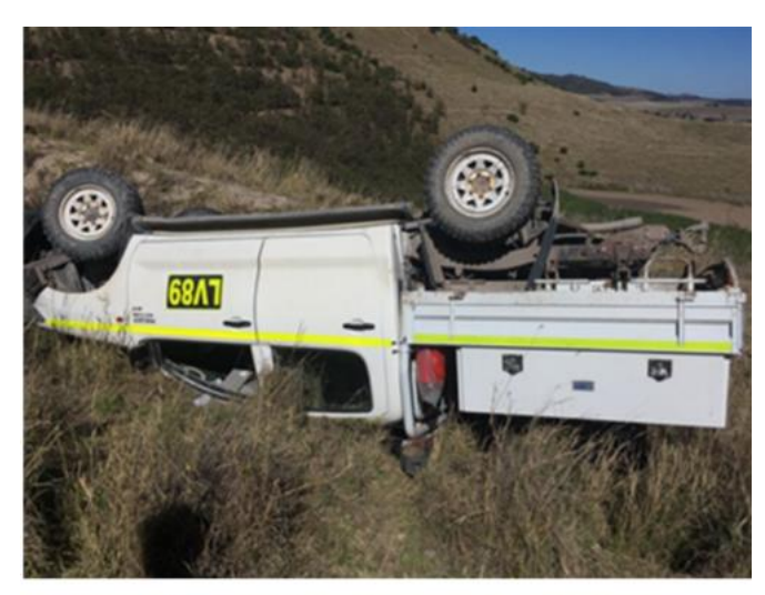
Figure 1 Light vehicle rollover on mine rehabilitation

One of the biggest safety threats continues to be heavy vehicles coming into contact with light vehicles or pedestrians.