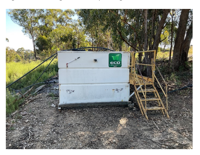
Figure 3. Aboveground sump being used to recirculate water for drilling.

Water for drilling activities is sourced from mine water dams on site. An above ground sump was observed in place for the drilling being conducted at site ELG157 (Figure 3). Dirty water and drill cuttings are removed from the sump as required and are disposed of within the tailings storage facility (TSF2) on site.