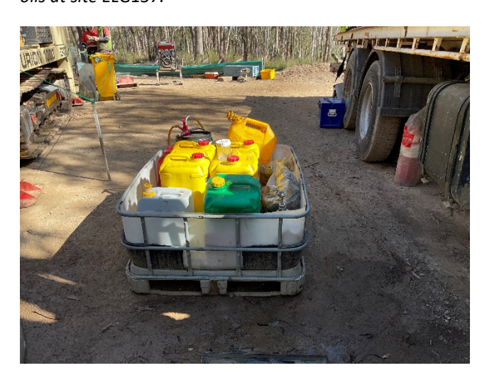
Figure 1. Secondary containment for chemicals, fuels and oils at site ELG157.