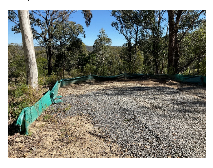
Figure 6. Sites ELG152, 153 and 154l drilled from the same pad.