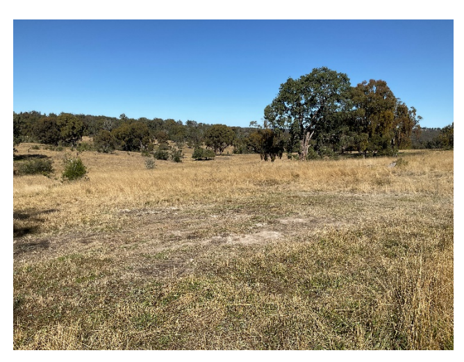
Figure 8. Rehabilitation of sites CUY007 and CUY009.