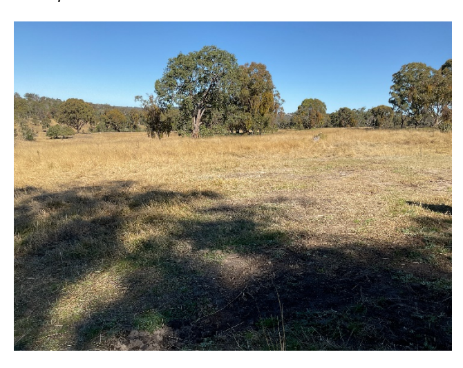
Figure 4. Drill sites CUY007 and CUY009 drilled from the same pad.